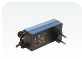
24 V 1.5 A power adapter