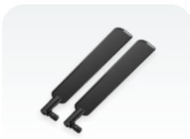
HGO indoor antenna kit