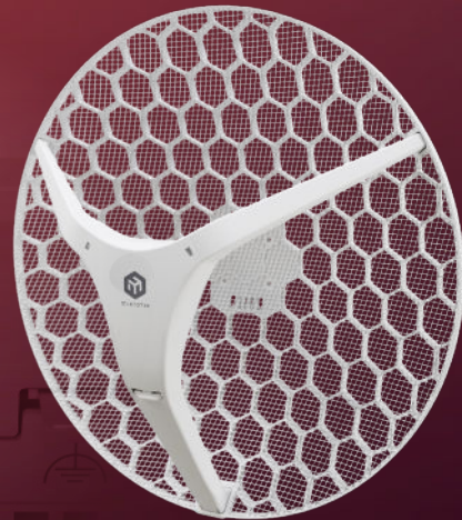
LHG 5 ax XL

A compact, long-range CPE with a 24.5 dBi antenna. Perfect for links up to 20 km in most scenarios.