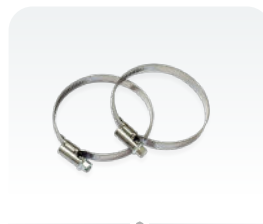
2x hose clamps