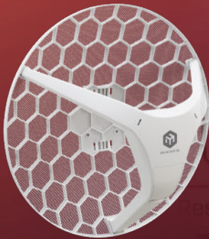
LHG 5 ax

Two Models. One Mission: reliable Wi-Fi 6 long-distance links.