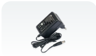
24 V 0.8 A power adapter